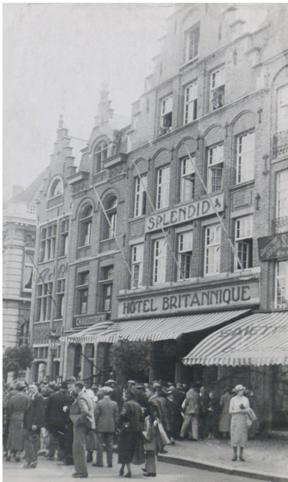
Photo: The Hôtel Britannique, circa 1935. It was here that the idea of the Last Post Ceremony was first discussed.