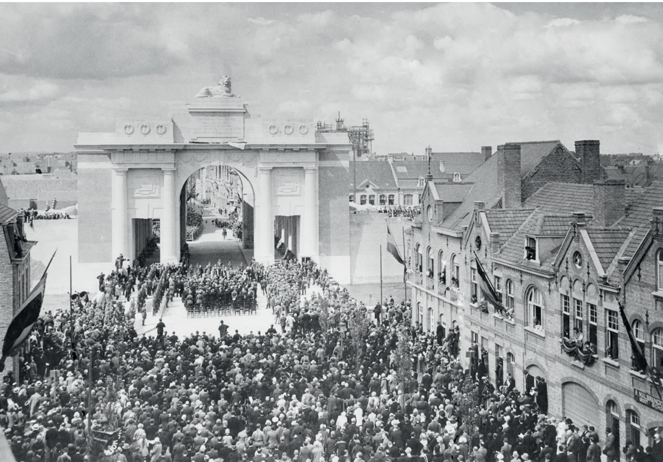
Photo: Crowds through the Frenchlaan during the inauguration and dedication of the Menin Gate Memorial to the Missing on 24 July 1927.