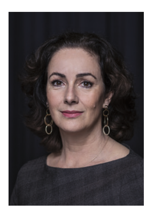
FEMKE HALSEMA Mayor of Amsterdam